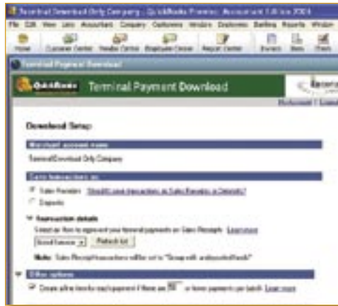
One screen is all it takes to download transactions from your terminal.

After the download is complete, the Download Report screen shows the payments and the corresponding deposits or sales receipts. If you chose to break up the batch by individual payment transactions, you'll see a line item corresponding to each payment transaction.