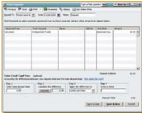
The Funding Status screen lets you sort transactions by date and card type.

For deposits that are funded to your bank account net of processing fees, use the Fee Calculator screen to keep track of the fees associated with these payments.