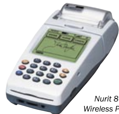
Nurit 8000 Wireless Palmtop